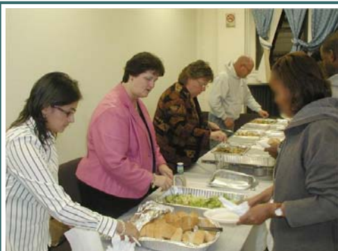
Rotarians serving dinner to temporary residents at the YMCA shelter in Plainfield.