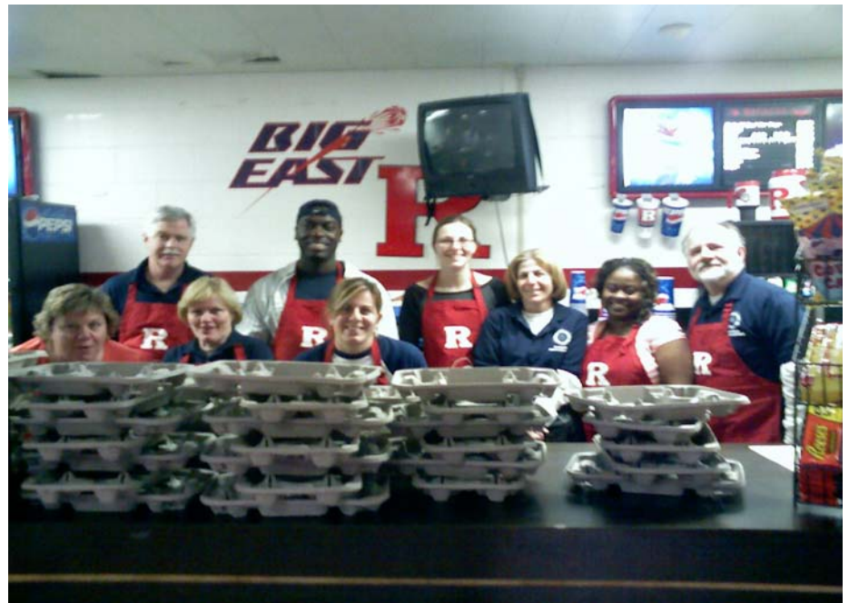
Club members and friends are ready for the crowd at the Rutgers v. Jackson State game. This crew took care of Booth #2, while others staffed Booth #1, the popcorn stand, and the sausage & pepper cart.

Our 2006-2007 Rutgers basketball season began with a fine effort by everyone who helped out at the Louis Brown Athletic Center on November 21.