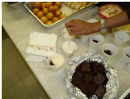
Dessert brought by the McWilliams family included homemade brownies and vanilla ice cream!