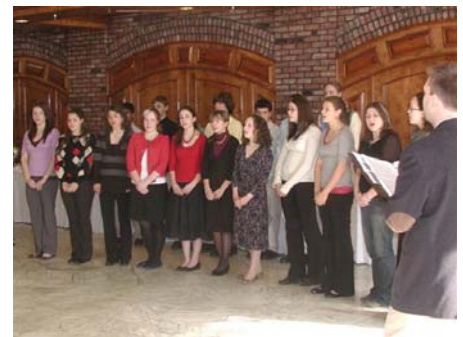
Eighteen members of the 180-member Choir from SPFHS perform a program of holiday music.

The food at Snuffy's was none too shabby, either.