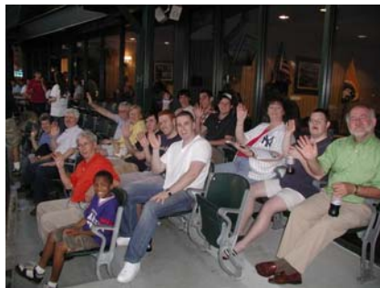
Fans enjoying our balcony seating just outside the luxury suite.

Despite an initial rain delay that pushed back the opening pitch until nearly 7:30 PM, the Patriots took the field and played a tight game.