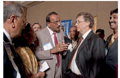
Governor-elect Lalit Shrimal of District 3040 (India) talks with Bill Gates during a private meeting held at the 2009 International Assembly.

In response to the new $255 million Gates Foundation grant, Rotary will raise $100 million in matching funds. In November 2007, RI received a $100 million Gates Foundation grant, which Rotary committed to match by raising $100 million.