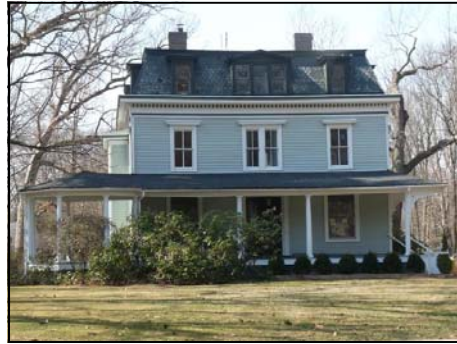
The front porch is just one of three that adorn the outside of this grand Victorian. The property is large, open, and well-suited to a growing family.

Vicky's contractor is credited with a number of features that help bring out the charm of this grand home. For example, he constructed closets in the third floor bedrooms where none existed before, and they blend in seamlessly. He also selected light fixtures that compliment the home.