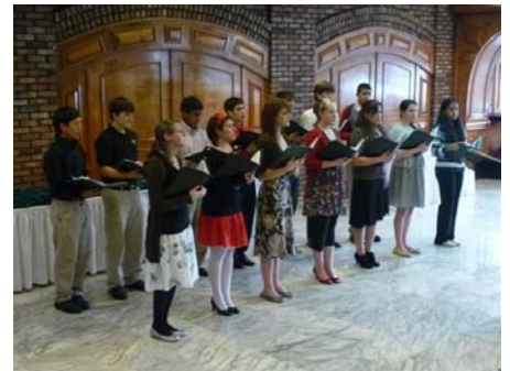
Members of the Fanwood-Scotch Plains High School Choir perform Christmas and Hannukah holiday music..

Several club members remarked that the mix of songs was more traditional than normally heard with the politically correct holiday season.