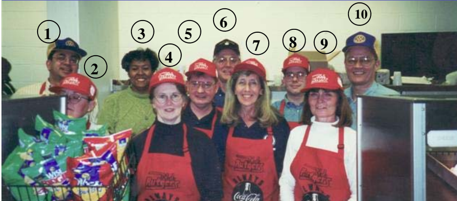
One of our earliest efforts at Rutgers is pictured above. Can you name the participants and tell the year? Not all are/were members. Send your guesses to the Editor at RotaryPNP@verizon.net .