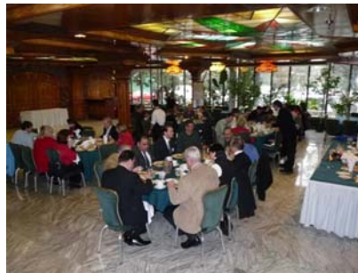
Rotarians from both clubs enjoy fellowship along with the students from FSP choir at Snuffy's Restaurant..

Rotarians from the Fanwood-Scotch Plains club were joined by eight of our members and one guest to celebrate the holiday season.