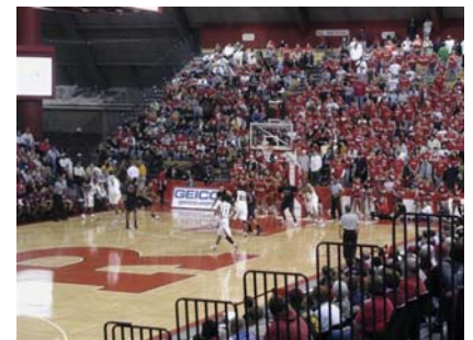
The men's basketball team at work in the Rutgers Athletic Center. With a mediocre record this year, there was not a lot to cheer about at these games.

That also proved to be more of a challenge than we anticipated. With the exception of one game where ten members came out, D/GB's participation averaged 3 workers per game. As a result, their share of profits was $1490 vs. ours of $4650.